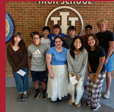
National Merit recognizes 10 Indian Hill High School students