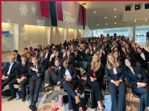
Indian Hill High School DECA Students Earn Record State Qualifications