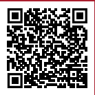
IH ARTS CONSERVATORY: Indian Hill Middle School student-musicians selected for OMEA